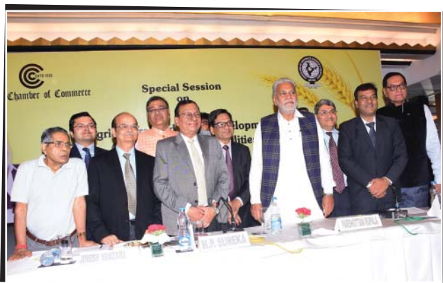
Special Session on Agricultural and Rural Development - Challenges and Possibilities with Sri Parshottam Rupala, Hon'ble Union Minister of State for Agriculture and Farmers Welfare organised jointly with Calcutta Chamber of Commerce on 24th November, 2019.