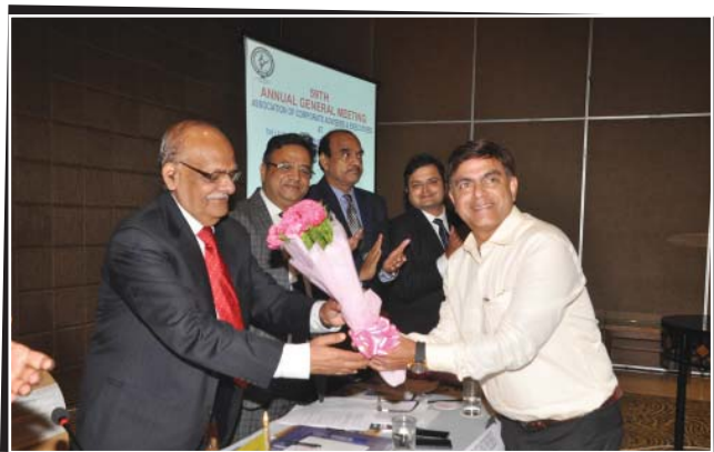
59th Annual General Meeting of ACAE on 13th September, 2019 at The Lalit Great Eastern Kolkata.