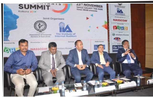
Digital Accountants Summit Kolkata 2019 On 23rd November, 2019 at The Park, Kolkata - Panel Discussion on CAs Leading Digital Transformation.