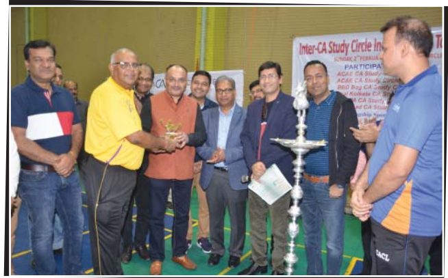
8th Inter-CA Study Circle Indoor Cricket Tournament on 2nd February, 2020 at Space Circle, Kolkata.