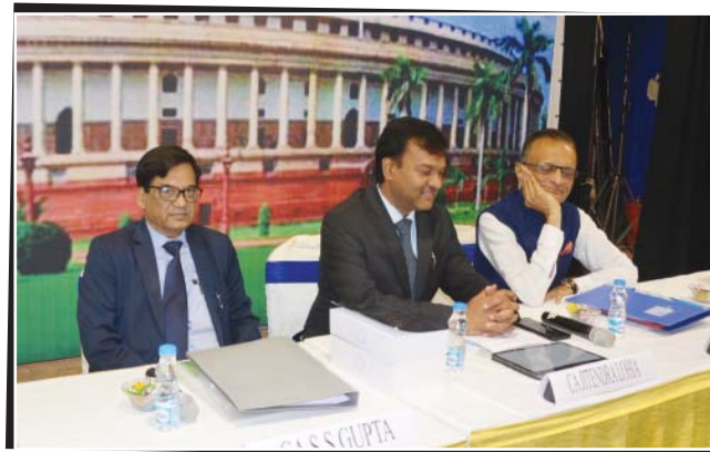
Seminar on Union Budget 2020 on 3rd February, 2020 at Rotary Sadan, Kolkata.