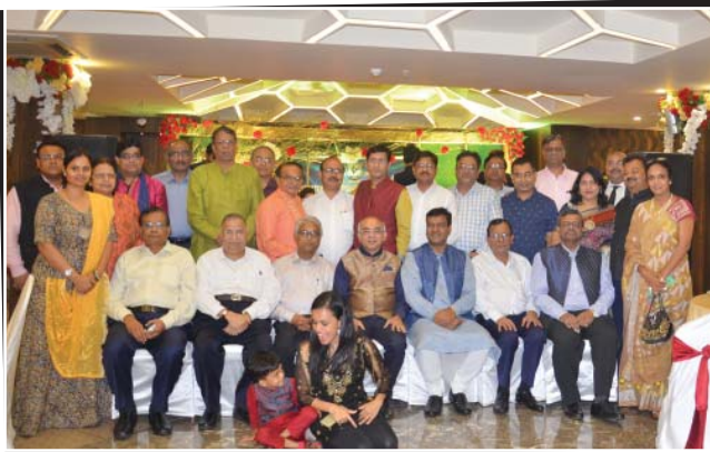
Bijoya & Deepawali Get-together on 8th November, 2019 at Ideal Banquets & Gardens, Kolkata.