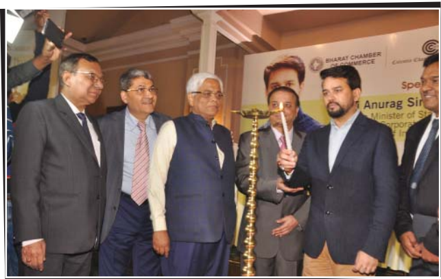
Special Session & Interaction with Shri Anurag Singh Thakur, Hon'ble Minister of State for Finance & Corporate Affairs, Govt. of India. A joint initiative with MCCI, BCC, CCC, DTPA and ACAE on 16th January, 2020 at The Oberoi Grand, Kolkata.