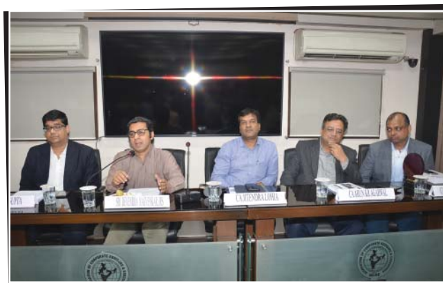
Interactive Session on Sabka Vishwas (Legacy Dispute Resolution) Scheme, 2019 and Recent Changes in GSTR 9/9C New GST Returns on 11th December, 2019 at ACAE, Emami Conference Hall.