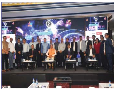
Information Technology Summit - Digital Future 4.0 on April 26, 2025