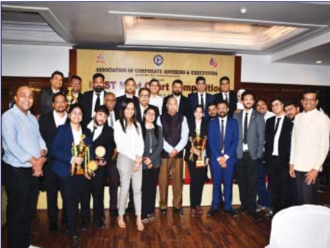
ARS GST Moot Court Competition held on 23 Nov 2024, a competition between 8 professional Associations