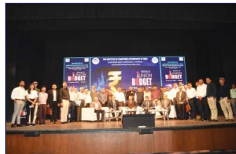
Seminar on Union Budget on 4th February 2025 at Kala Mandir, Kolkata, Organised By : EIRC of ICAI & Supported by All CPE Study Circles of EIRC of ICAI