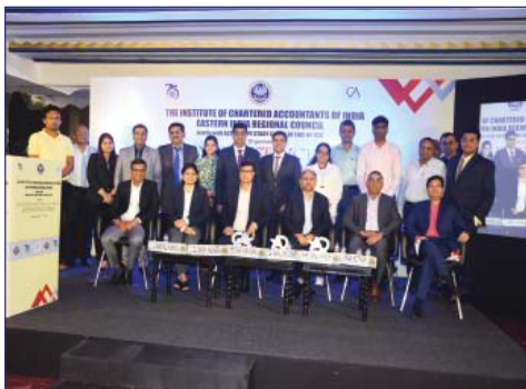
Business Restructuring & Financing Summit jointly with EIRC of ICAI on Oct 05, 2024