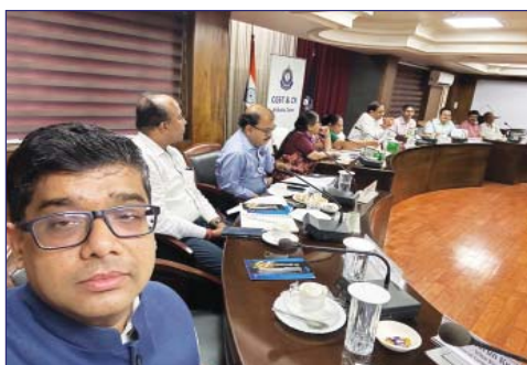
Participation in GST Grievance Redressal Committee meeting