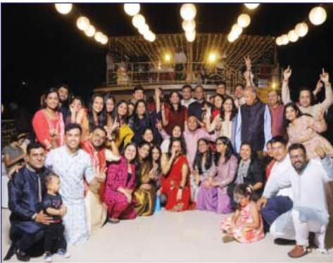
ACAE Deepawali and Bijoya family Meet held on Nov 09, 2024