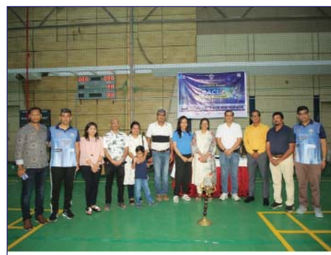
CA Cricket League 2025