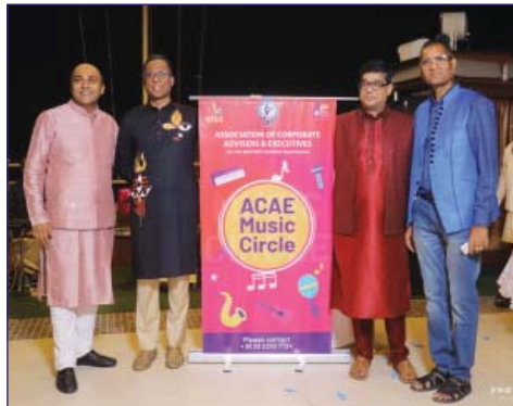
Launch of ACAE Music Circle