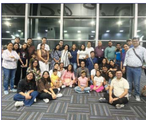
International Trip to Bali, Indonesia from June 3rd, 2025 to June 9th, 2025