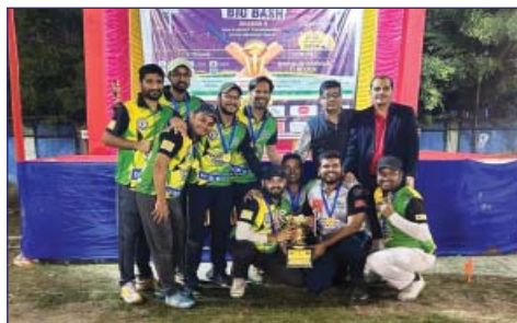
ACAE wins BIG BASH 4.0 Outdoor Cricket Tournament 2024