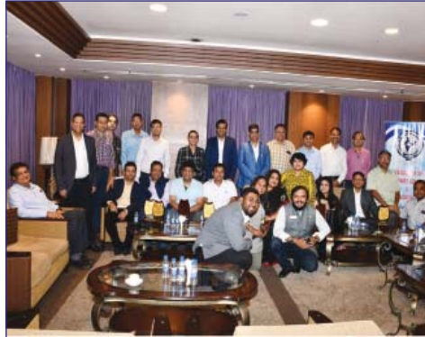
Business Connect Session held on Sep 25, 2024