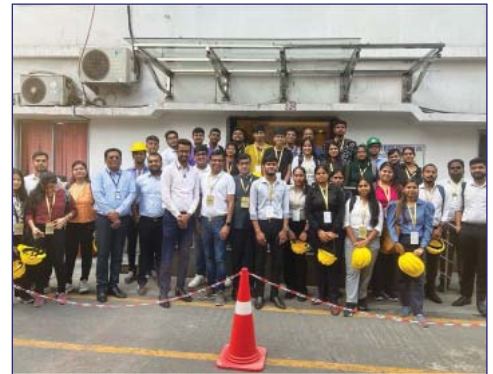
Industry visit of Students to a Factory on 15 Nov 2024