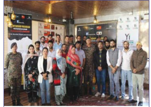
Mentorship Program for Start-ups in Kashmir - ACAE is Knowledge Partner, on October 14-15 at Roshan Mustaqbil Youth Centre, Kupwara, J&K