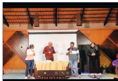
ACAE Drama Circle holds a Drama on the occasion of Launch of ACAE Young Leaders Forum titled Avsar (meaning Opportunity)