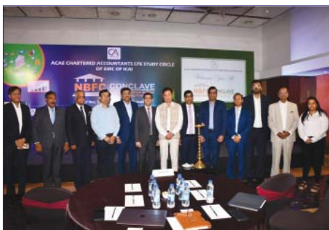
NBFC Conclave on the theme Audit, Assurance & Risk: Building Trust on Saturday, 31st May, 2025