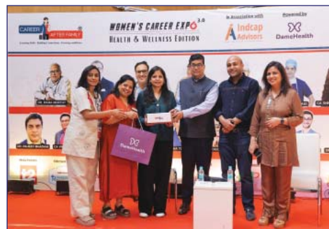
CAFE organised Women's Career Expo, Health & Wellness Edition on April 4th & 5th at ICCR - ACAE WOMEN'S FORUM joins as Community Partner