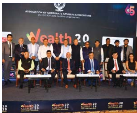
WEALTH SUMMIT on Saturday, June 28, 2025