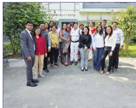
ACAE celebrates International Women's Day with the women in uniform on March 08, 2025