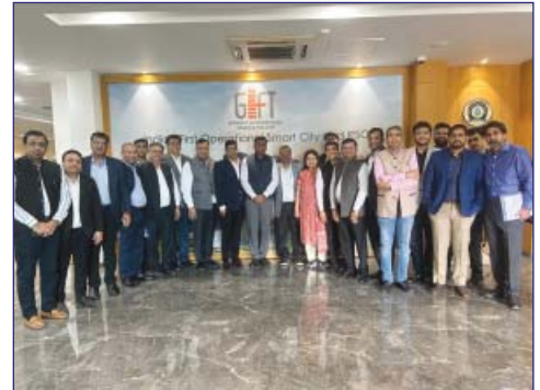
Business Delegation visit to GIFT City & IFSCA on Dec 04, 2024