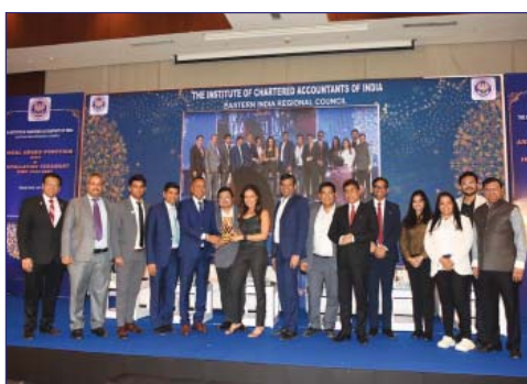
EIRC of ICAI recognises ACAE CA Study Circle's contribution to the profession