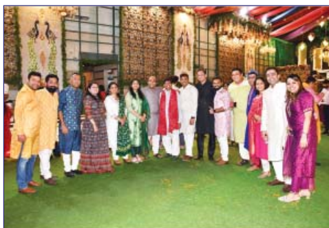
Holi Preeti Sammelan held on Saturday, March 15th, 2025