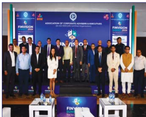
FINVISION SUMMIT 2025 on the theme "The Future of Finance"