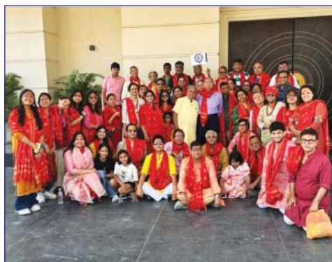
Religious Trip to Ayodhya & Varanasi from 28th - 30th March 2025