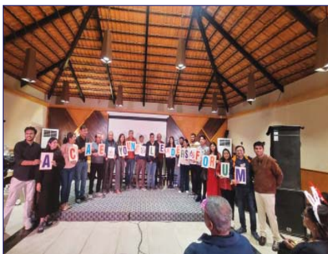
Launch of ACAE Young Leaders Forum