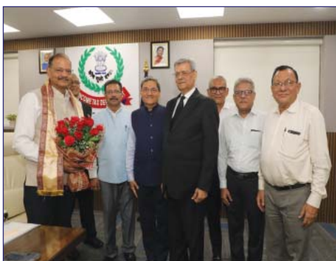
Interactive session with the Hon'ble CBDT Member (Legislation) on 17.04.2025