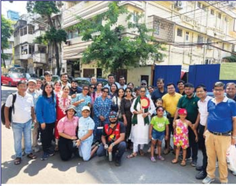
Visit to Kumartuli on Sep 22, 2024