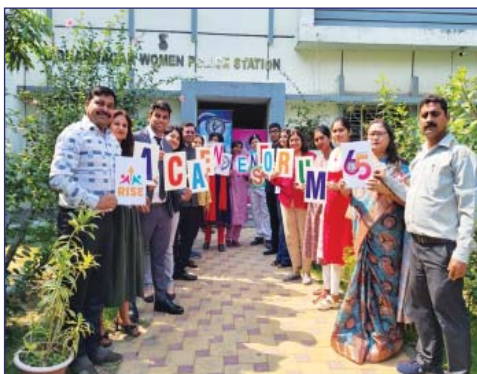
Launch of ACAE Women's Forum