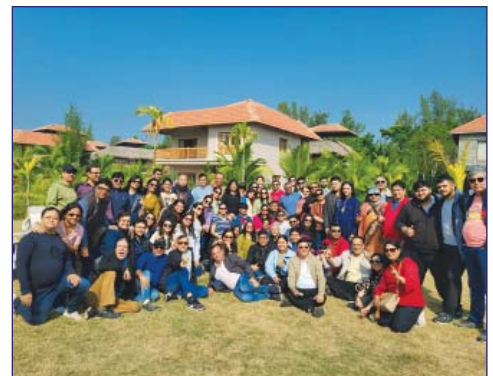
Residential Picnic of members at Sunderbans from 10- 12 Jan 2025