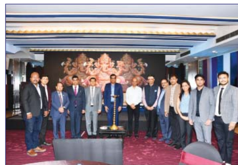
GST Summit 2025 on Saturday, 26th July 2025