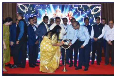
Finance & BFSI Conclave 2025 held on Thursday, July 17, 2025 at HHI, Kolkata organised by MASA and CWBTA alongwith banks & financial institutions