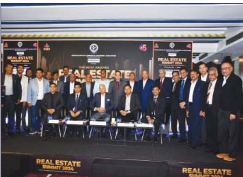
8th Edition of Real Estate Summit 2024 held on 14th December 2024