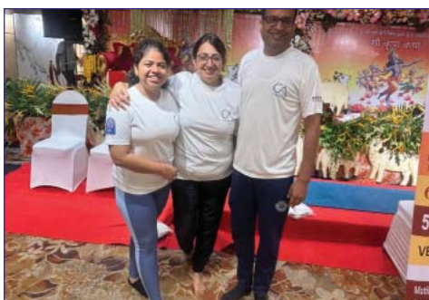
Participation in 11th International Yoga Day 2025 held on 21st June 2025 - Organised by EIRC of ICAI with all Study Circles